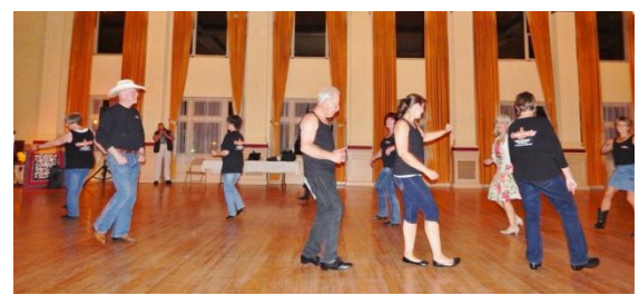
Rockin Deuce Demo