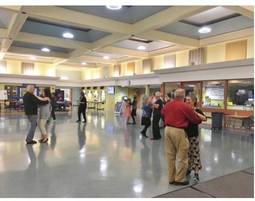
Dance Class Week #2 - 10/12/16