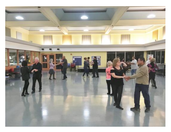
Dance Class Week #3 - 10/19/16