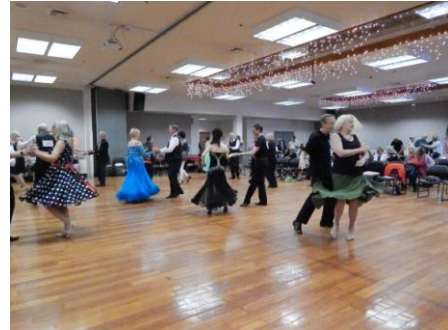
General dancing between heats