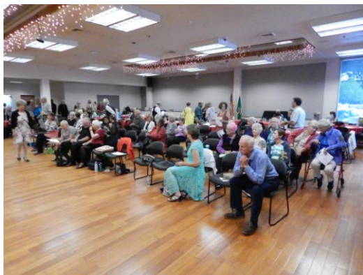
Spectators and competitors