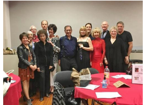
Some of our Dance Club dancers who came to support and cheer on the competitors at the 2018 Senior Games Dance Competition

Photos of the heats posted on Flickr: www.flickr.com/photos/sjpleusphotos/albums/ . Videos of the heats, exhibition, demonstrations and awards ceremonies, posted on YouTube: www.flickr.com/photos/sjpleusphotos/albums/ . The website is being updated soon as well. Check us out at www.danceclubofgraysharbor.com .