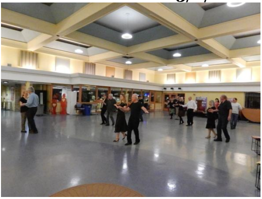
GHC Dance Class 3/16/16